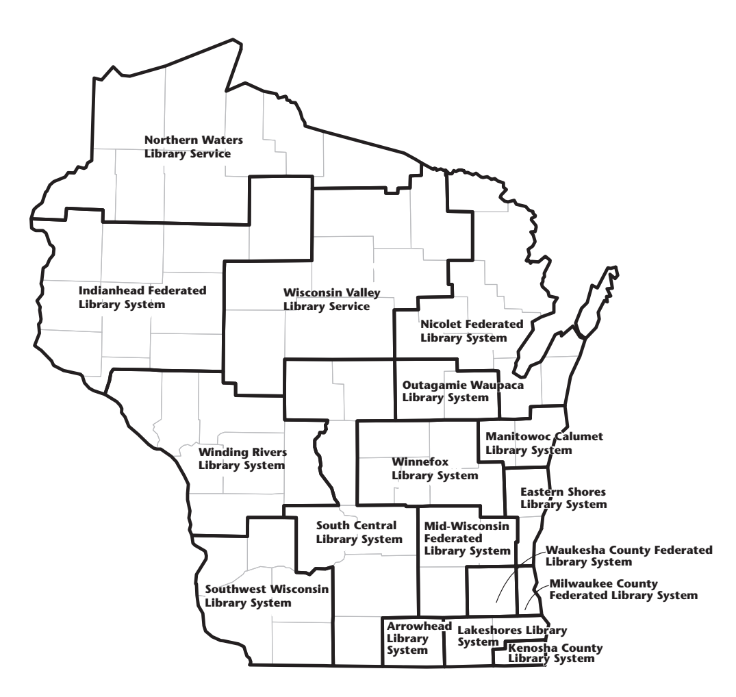
Figure 3 Regional Library System Boundaries

Libraries must meet certain statutory requirements to belong to a regional library system.