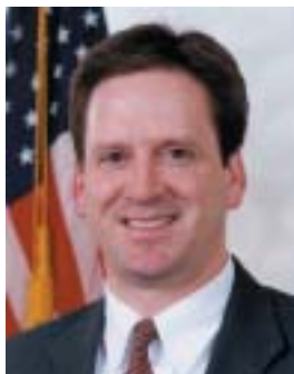
U.S. Representative GREEN