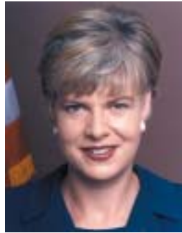
U.S. Representative BALDWIN