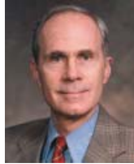
Secretary of State La FOLLETTE