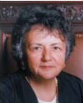
Chief Justice ABRAHAMSON