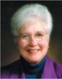
Lieutenant Governor FARROW