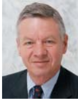
U.S. Representative PETRI