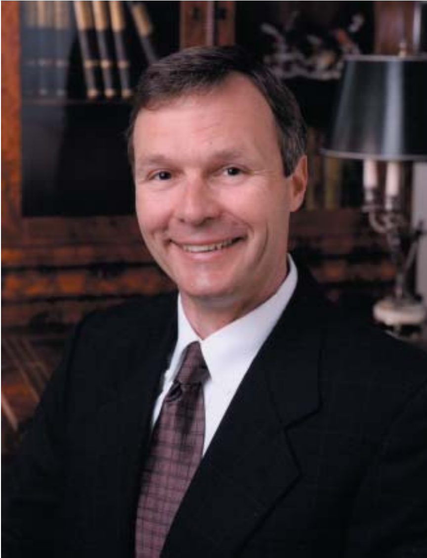
Governor SCOTT McCALLUM