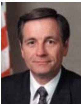
U.S. Representative KLECZKA