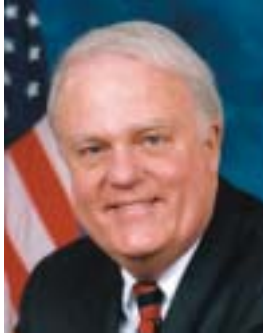
U.S. Representative SENSENBRENNER