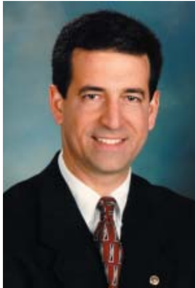
U.S. Senator FEINGOLD