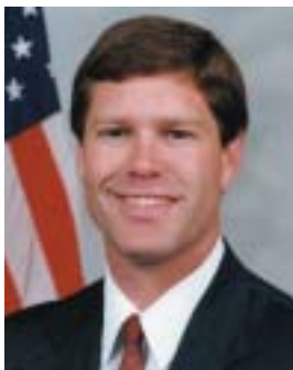
U.S. Representative KIND