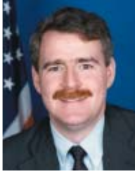
U.S. Representative BARRETT