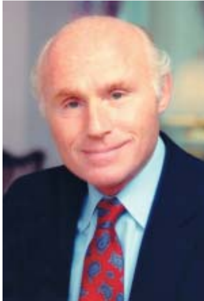
U.S. Senator KOHL