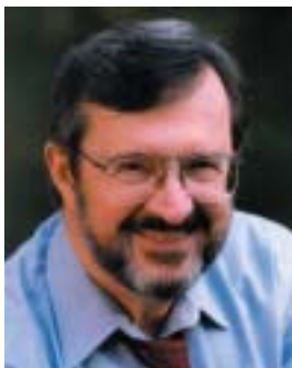
U.S. Representative OBEY