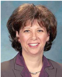
Attorney General LAUTENSCHLAGER