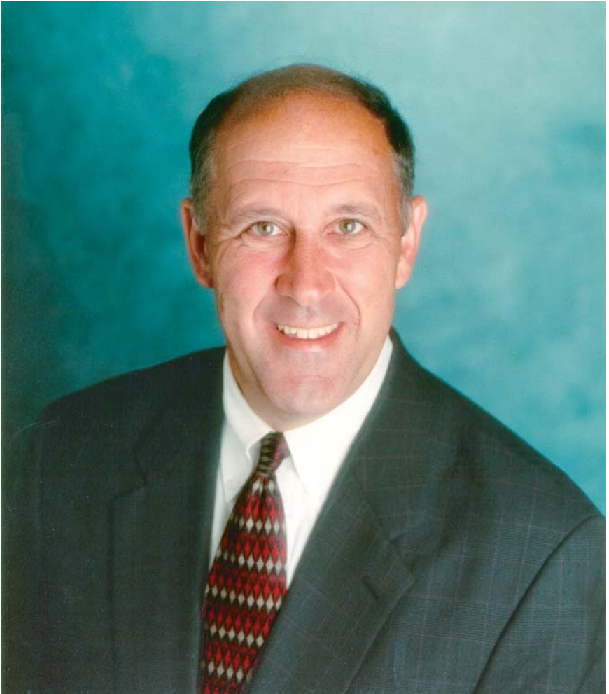
Governor JIM DOYLE