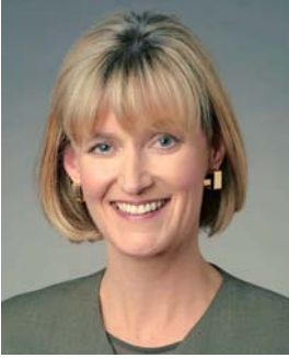
Lieutenant Governor LAWTON