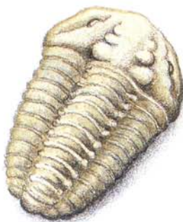
Trilobite STATE FOSSIL