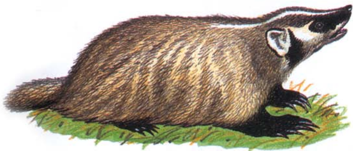
Badger STATE ANIMAL