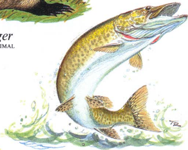
Muskellunge STATE FISH