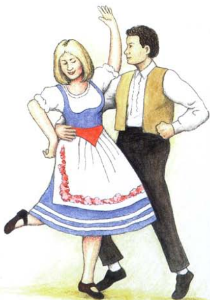
Polka STATE DANCE