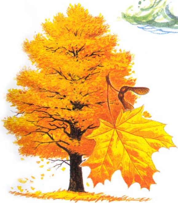
Sugar Maple STATE TREE