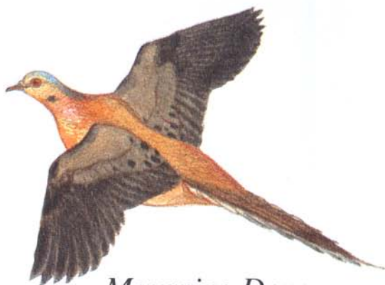
Mourning Dove SYMBOL OF PEACE