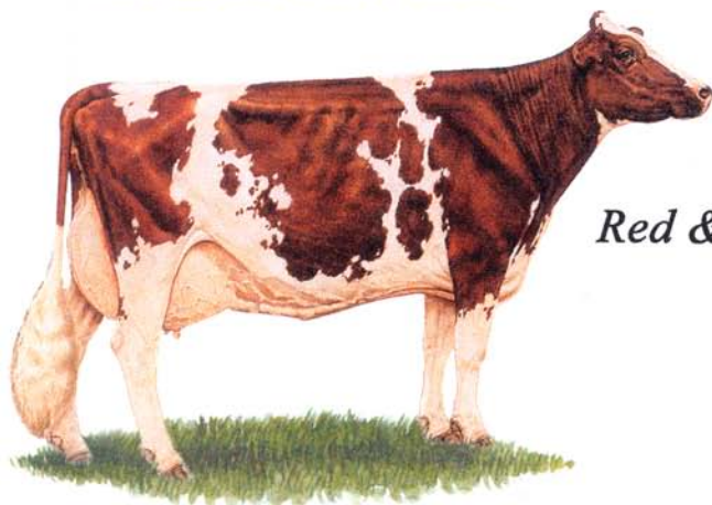
Red & White Holstein