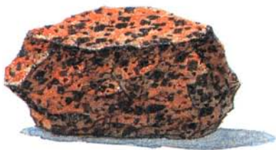
Red Granite STATE ROCK