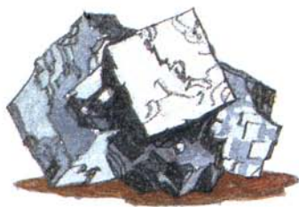
Galena STATE MINERAL