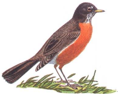
Robin STATE BIRD