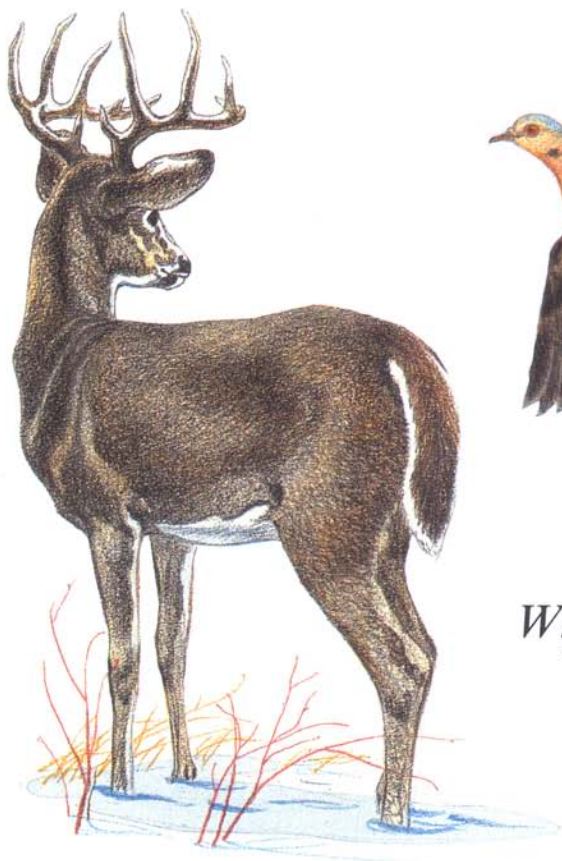
White-tailed Deer STATE WILDLIFE ANIMAL