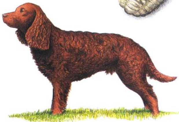
American Water Spaniel STATE DOG