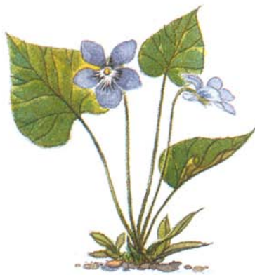
Wood Violet STATE FLOWER