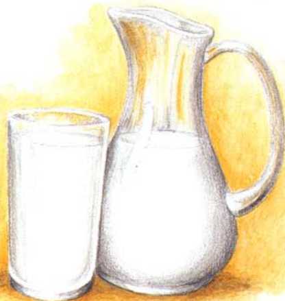
Milk STATE BEVERAGE