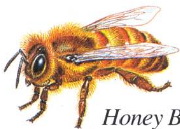
Honey Bee STATE INSECT