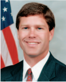
U.S. Representative KIND