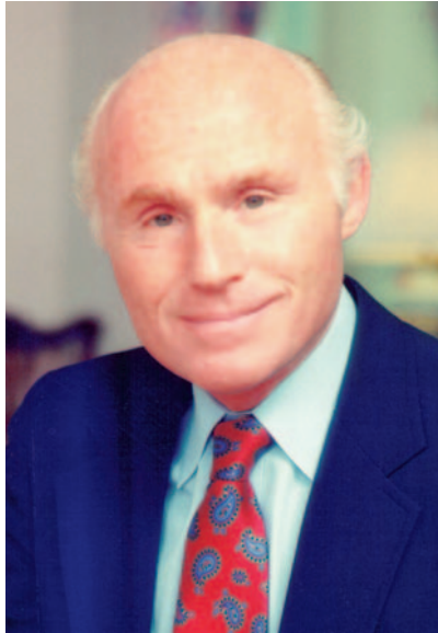
U.S. Senator KOHL