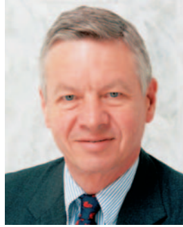
U.S. Representative PETRI