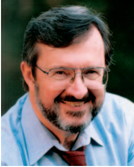
U.S. Representative OBEY