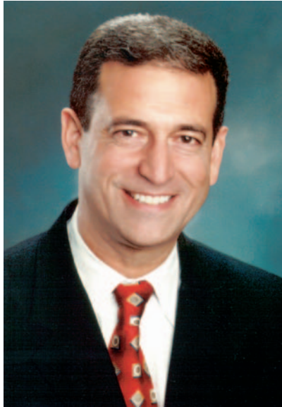
U.S. Senator FEINGOLD