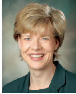
U.S. Representative BALDWIN