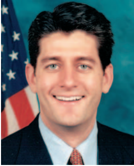
U.S. Representative RYAN