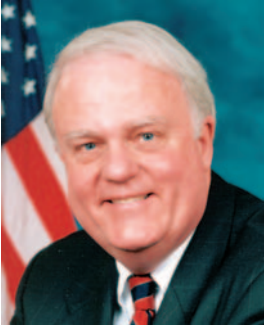
U.S. Representative SENSENBRENNER