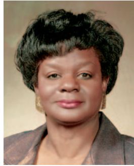
U.S. Representative MOORE