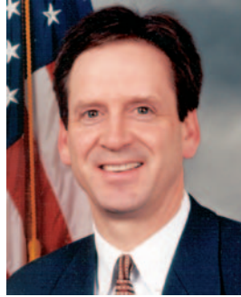
U.S. Representative GREEN