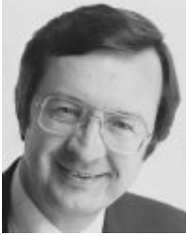
U.S. Representative OBEY