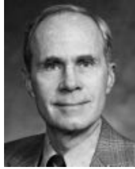
Secretary of State La FOLLETTE