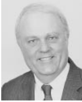
U.S. Representative SENSENBRENNER