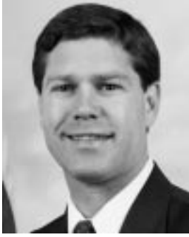
U.S. Representative KIND