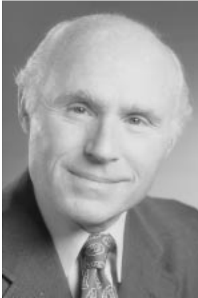
U.S. Senator KOHL