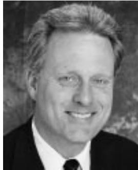
U.S. Representative KLUG