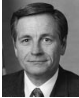
U.S. Representative KLECZKA