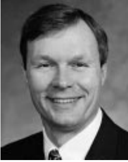
Lieutenant Governor McCALLUM