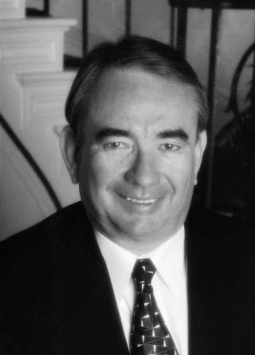
Governor TOMMY G. THOMPSON