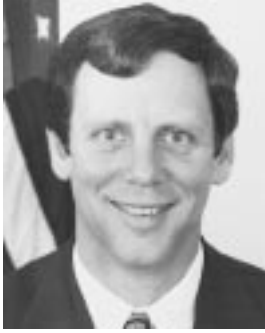
U.S. Representative NEUMANN