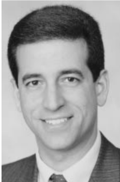
U.S. Senator FEINGOLD