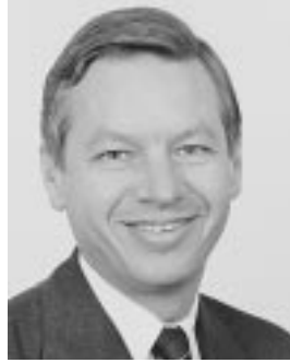
U.S. Representative PETRI