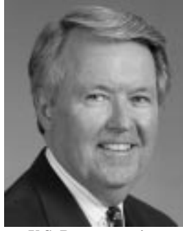
U.S. Representative JOHNSON