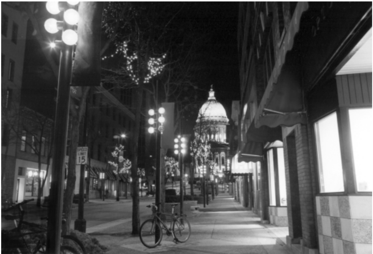
State Street; Kathleen Sitter, LRB